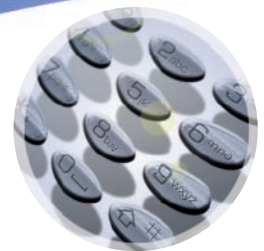
GSM / 3G