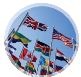
International Market Access