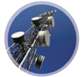
4G / LTE / WiMAX

Head Office - Pavilion A, Ashwood Park, Ashwood Way, Basingstoke, Hampshire RG23 8BG United Kingdom